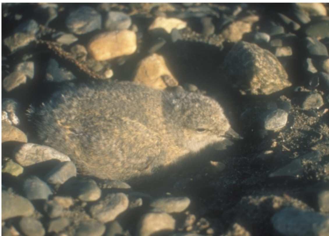
Plate 2. The chick found at Estancia Glencross on the Río Gallegos on 12–13 February 2002 (Site 3, Fig. 1, Table 1).