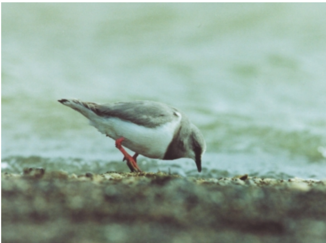
Plate 1. An adult Magellanic Plover on the shore of Lago Argentino on 30 November 2001.