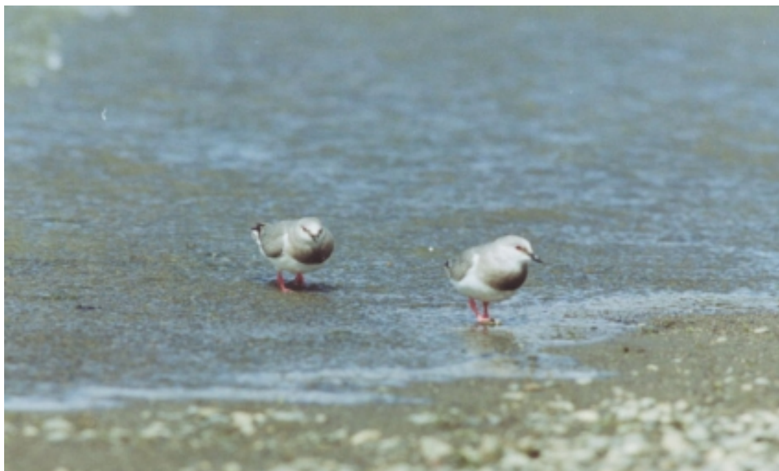
Plate 3. Two adult Magellanic Plovers feeding on intertidal mud on the Gallegos estuary on 3 August 2002 (photo by Carlos Albrieu).